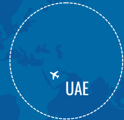
Range Map - Learjet 60XR